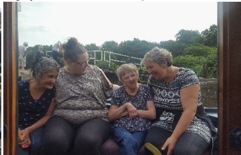
Far Right - our canal boat adventure.